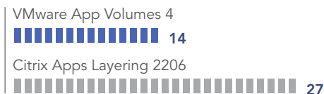
Figure 2: The number of major tasks necessary to deploy an application using each solution. Lower is better.