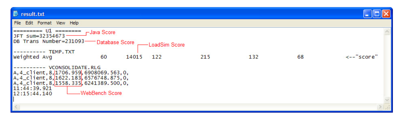
Figure 11: Example of vConsolidate results file.

Figure 11 shows an example results.txt file for a test with one CSU. We have labeled each score with a brief description. See the Test results section for more information on how we used these individual results to calculate each server's overall score on the workload.