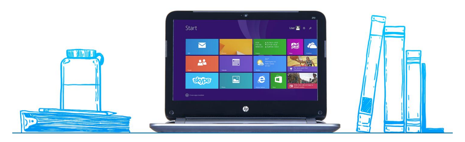
Compared to an Apple® iPad Air™ and a Google® Nexus 10™

The Intel® processor-powered HP 210 G1 Notebook PC, running Windows® 8.1, displayed educational content with greater success than distract and frustrate students. the ARM<sup>o</sup>-based devices we tested.