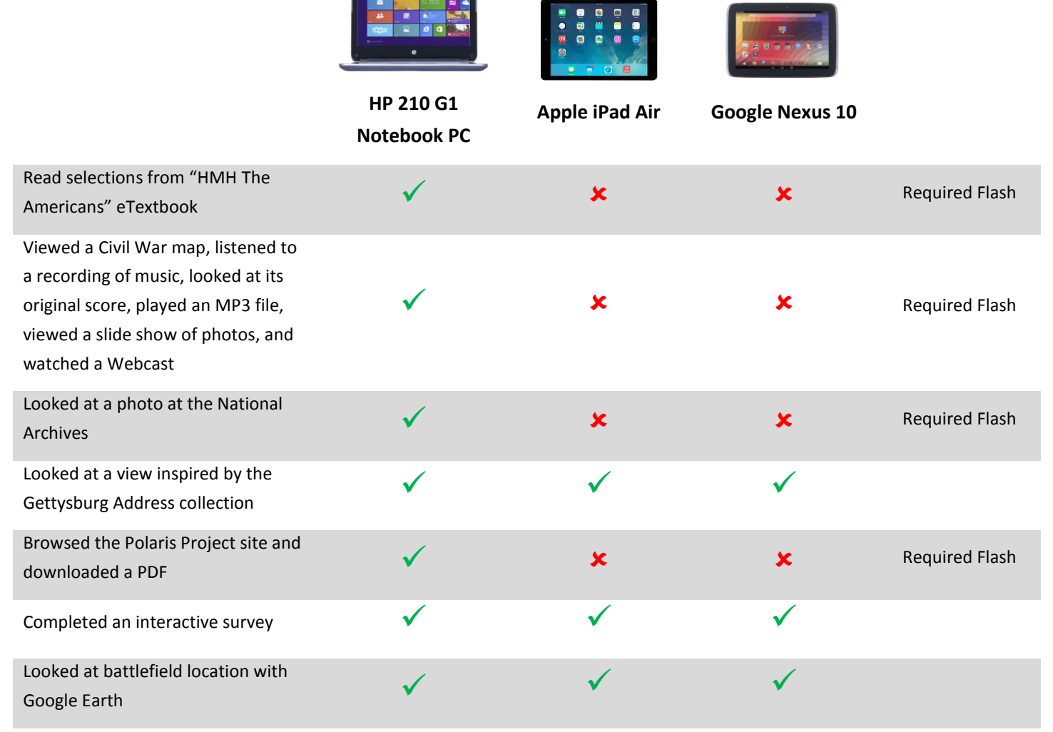
Figure 6: The compatibility of our test devices with the tasks in this scenario. The Web sites and their activities are typical of those used in high school social studies classes.