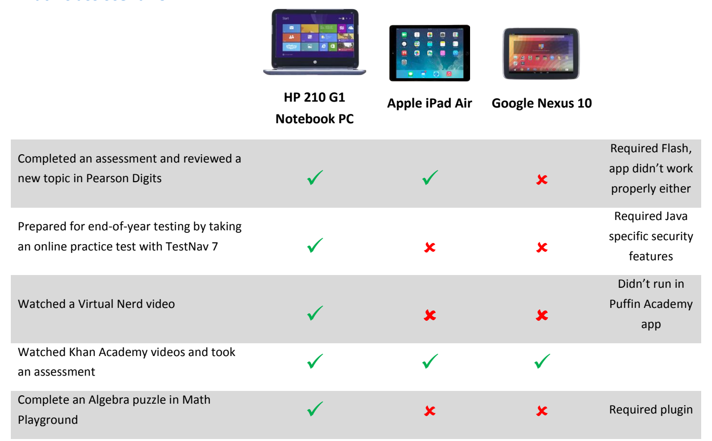
Figure 4: The compatibility of our test devices with the tasks in this scenario. The Web sites and their activities are typical of those used in middle school math classes.