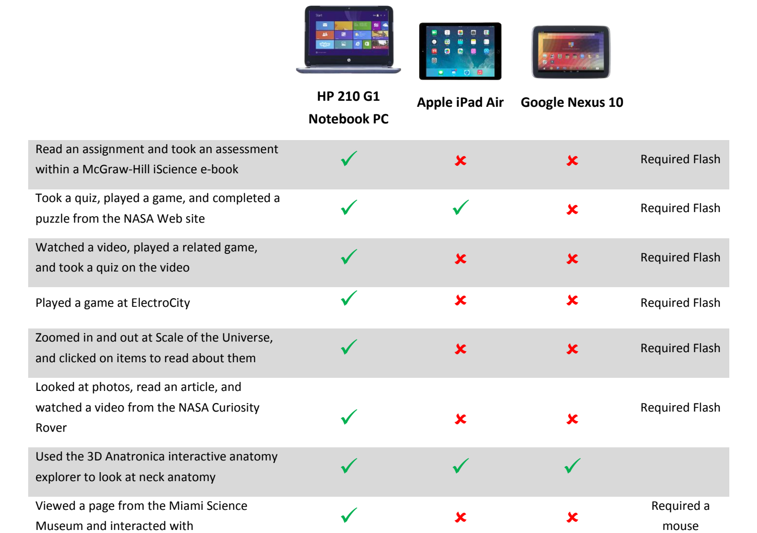
Figure 3: The compatibility of our test devices with the tasks in this scenario. The Web sites and their activities are typical of those used in middle school science classes.