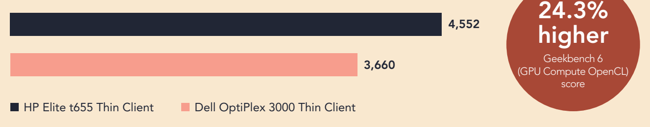
Figure 4: Geekbench 6 (GPU Compute OpenCL) benchmark scores. Higher is better.