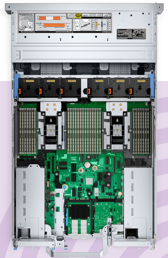
Configuration may differ from the server we used for testing.

To learn more about the PowerEdge R7625 server, read the announcement at https://www.hpcwire.com/off-the-wire/dell-technologies-announces-dell-poweredge-servers-with-4<sup>th</sup>-gen-amd-epyc-processors/.