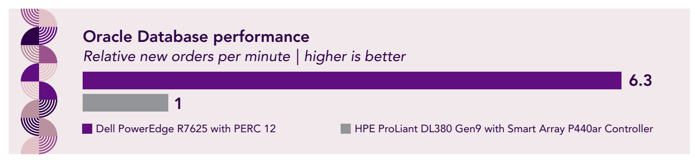
Figure 1: Relative database performance the servers achieved. Higher numbers are better.

In our tests, the Dell PowerEdge R7625 with PERC 12 achieved 6.3 times the total NOPM of the HPE ProLiant DL380 Gen9 (see Figure 1). Processing more orders in the same amount of time means that the PowerEdge R7625 can allow you to support more customers at once, or enable you to consolidate your data center by housing and running fewer systems to support your user base.