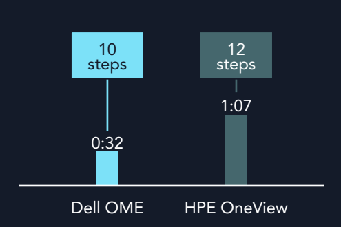
Figure 2: Comparison of the time and steps it took to deploy configuration templates with Dell OME vs. HPE OneView. OME can apply a template to many servers at once, increasing time savings even more. Less time and fewer steps are better.