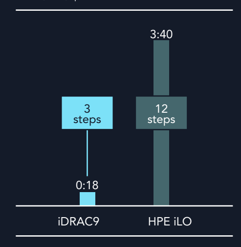
Figure 3: Comparison of the time and steps it took to complete the System Lockdown use case with iDRAC9 vs. HPE iLO. Less time and fewer steps are better.