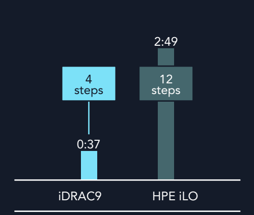
Figure 4: Comparison of the time and steps it took to complete the Dynamic USB use case with iDRAC9 vs. HPE iLO. Less time and fewer steps are better.