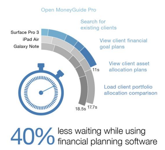
Figure 2: The amount of time spent waiting with the three tablets while using MoneyGuide Pro financial planning software. Lower numbers are better.

was even greater for some tasks, with the client portfolio allocation comparison taking almost twice as long to load on the iPad Air and Galaxy Note 10.1 than on the Surface Pro 3.