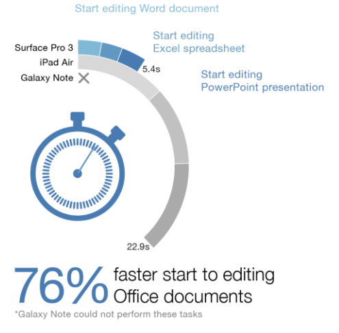
Figure 5: The amount of time it took to start editing Office documents with the three tablets. Lower numbers are better.