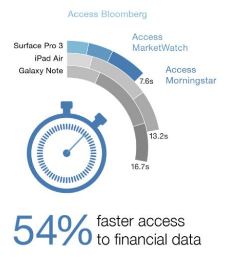
Figure 4: The amount of time it took to access financial data with the three tablets. Lower numbers are better.

As Figure 4 shows, the Surface Pro 3 could access financial data up to 54 percent faster than the competition. It took over three times as long to access MarketWatch on the Galaxy Note 10.1, and almost three times as long on the iPad Air. Using the Surface Pro 3 instead of the iPad Air and Galaxy Note 10.1 can mean saving valuable time.