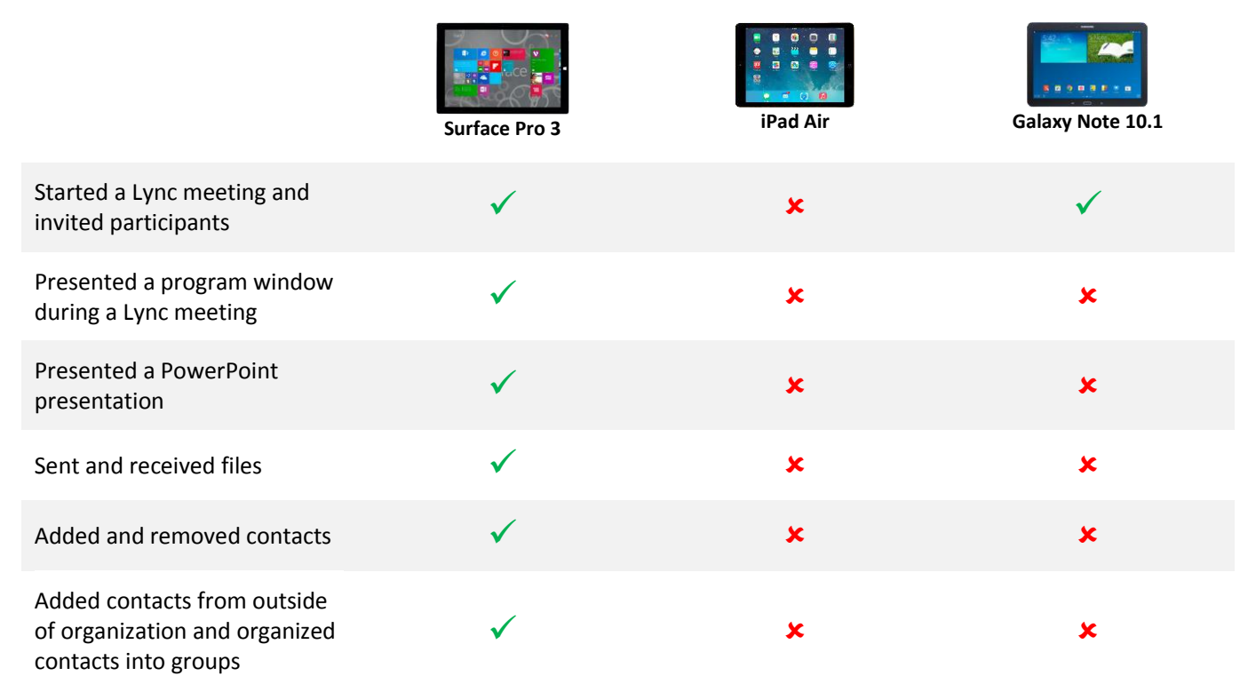
Figure 7: Lync feature support for wealth management professionals with the three tablets.

shows, we found much better feature support with the Lync desktop app on the Surface Pro 3 than with the respective apps on the iPad Air and Galaxy Note 10.1. Some missing features on the iPad Air and Galaxy Note 10.1 are showstoppers—we couldn't even drive a Lync meeting on the iPad Air.