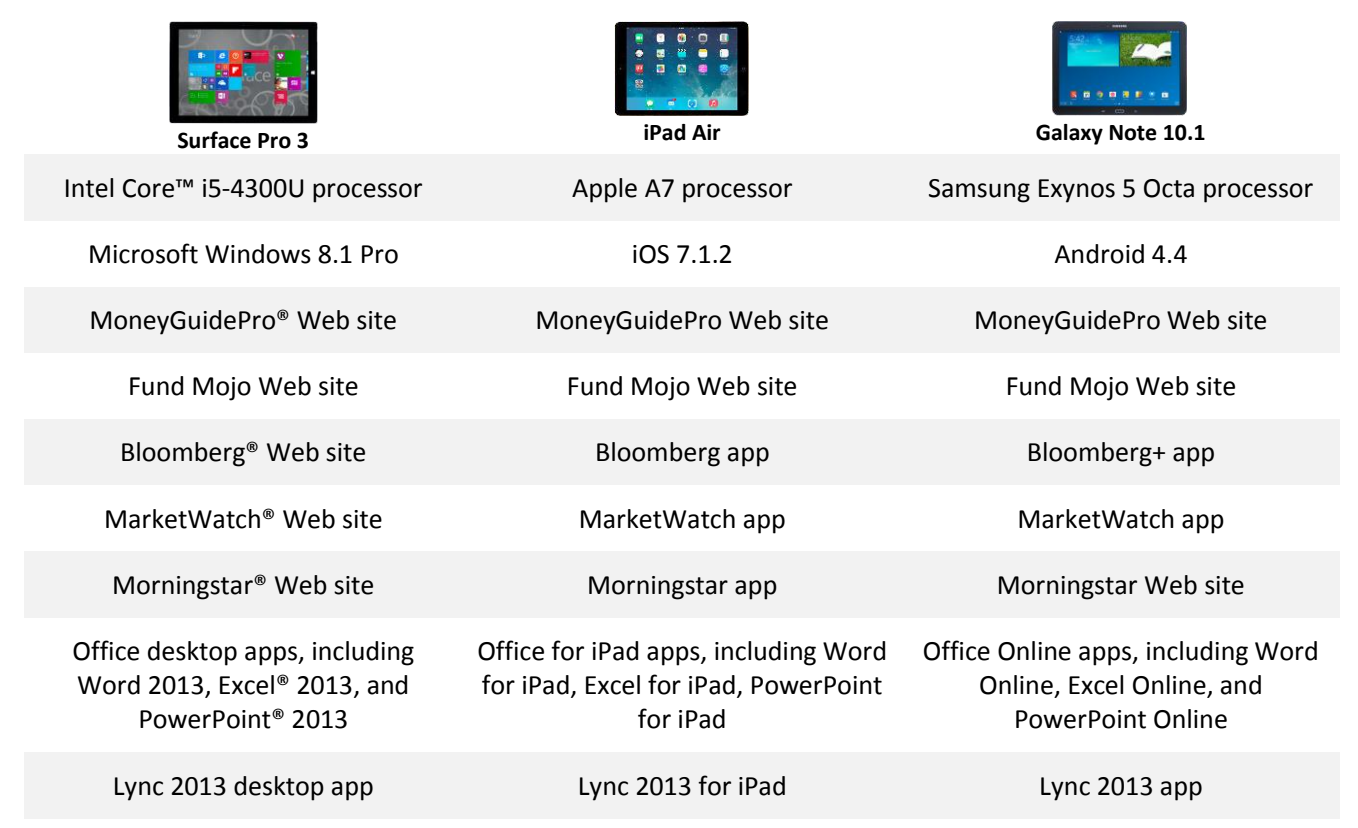
Figure 1. The three tablets we compared and the apps and Web sites we looked at with the tablets.

Figure 1 shows the three devices we compared. In addition to the Intel processor-powered Surface Pro 3 with Microsoft® Windows® 8.1 Pro, we looked at two ARM processor-based devices, each being a different operating system—iOS on the iPad Air and Android™ on the Galaxy Note 10.1. We used apps available for each device when possible, and used the browser to access Web sites when apps were not available.