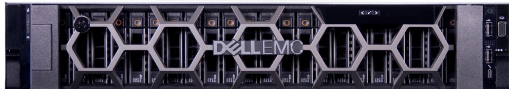
Dell EMC PowerEdge R740xd

In hands-on testing, we ran an order processing workload on a legacy Dell EMC™ PowerEdge™ R720xd server with older software, as well as the new 14th generation PowerEdge R740xd server running Microsoft® SQL Server 2017 Standard and Windows Server® 2016 Standard. The new solution significantly improved transactional database performance, processing almost seven times as many orders per minute and reducing user wait times. By upgrading your existing SQL Server environment to new Dell EMC servers and the latest software from Microsoft, you could increase transactional database performance immediately, with room for future business growth.